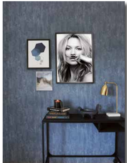
Decor 40593 Flow plain blue concrete/Classic collection.

comprises classic decorative finishes and surfaces. Numerous combinations where the classic striped wallpapers come with coordinating plain wallpapers. Exclusive and enduring results.