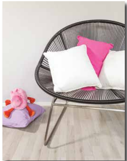
Decor 14244 Grey Textile/Basic collection.

Comprises simpler decorative finishes with understated surface for delicate, light and timeless rooms. Equally suitable in both private rooms as well as public environments.