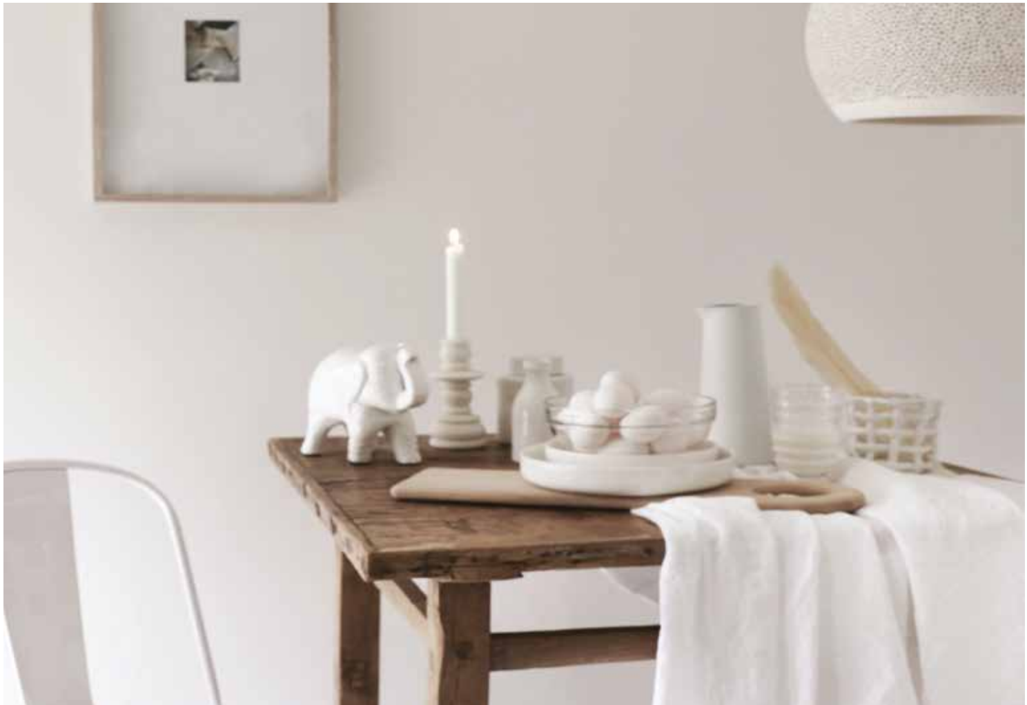
Decor 4147 white deco