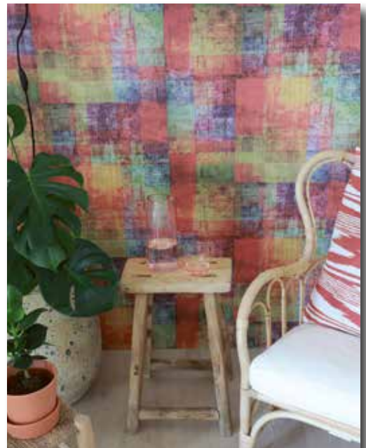
Decor 40900 Valentine/Trend collection.

is for those who want the very latest. Stylish both as a feature wall and for a whole room. Many variations.